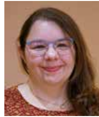
Haley Spaid Pace Water System